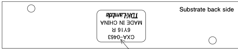
Example of label marking Product name, Lot No., Country of origin, TDK-Lambda logotype

High-voltage generator ※ (The entire surface within a range of 60mm away from the end of the basein) ※From high-voltage generator, please secure space distance more than 3mm in top and bottom right and left.